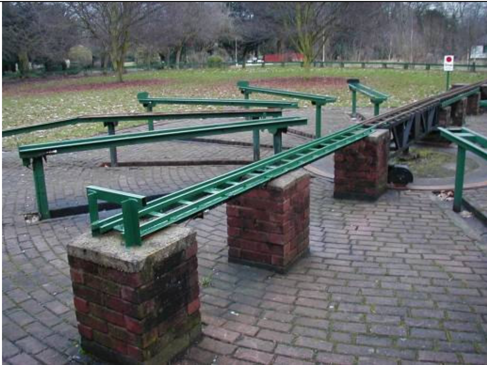
The Turn table and steaming bays got a lick of paint