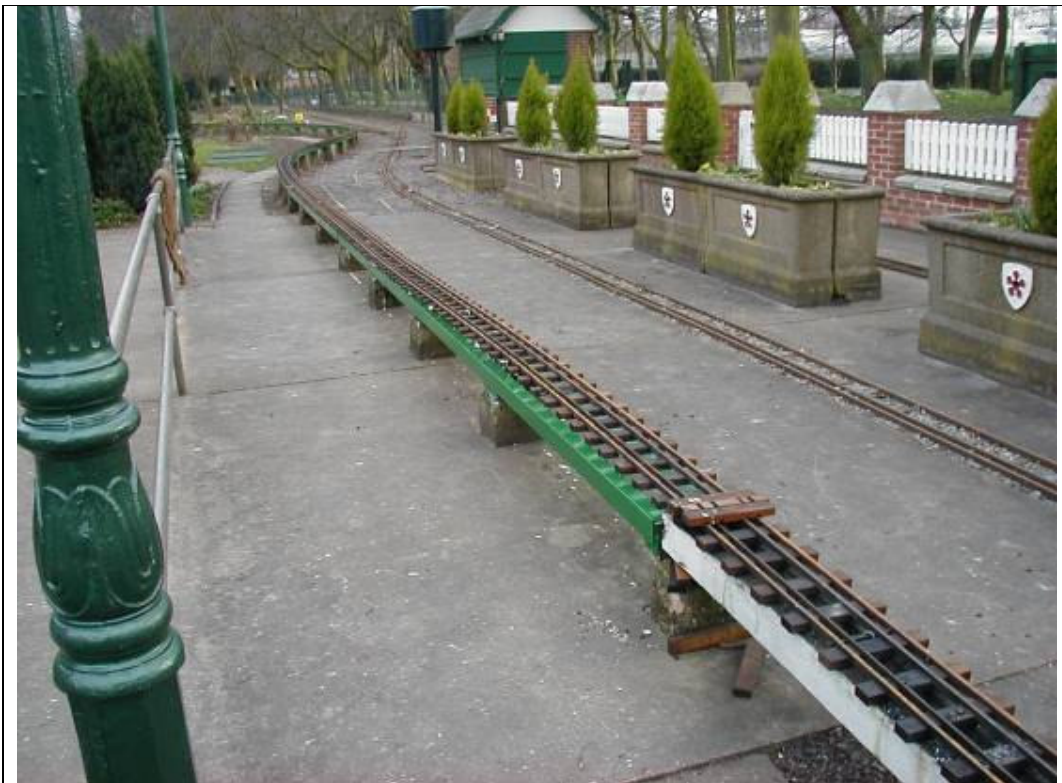
A few sleepers and a coat of paint on the raised track