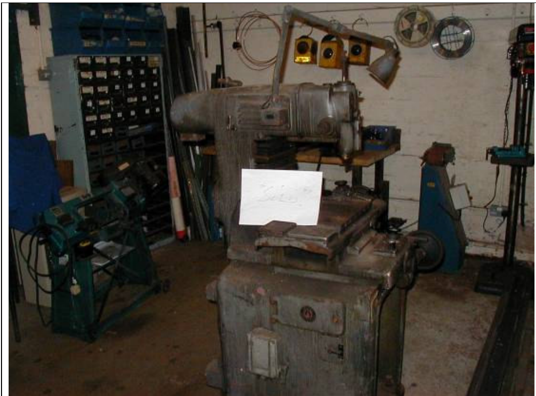
An old Jig boring machine fails to spark any interest so is consigned to the scrap heap