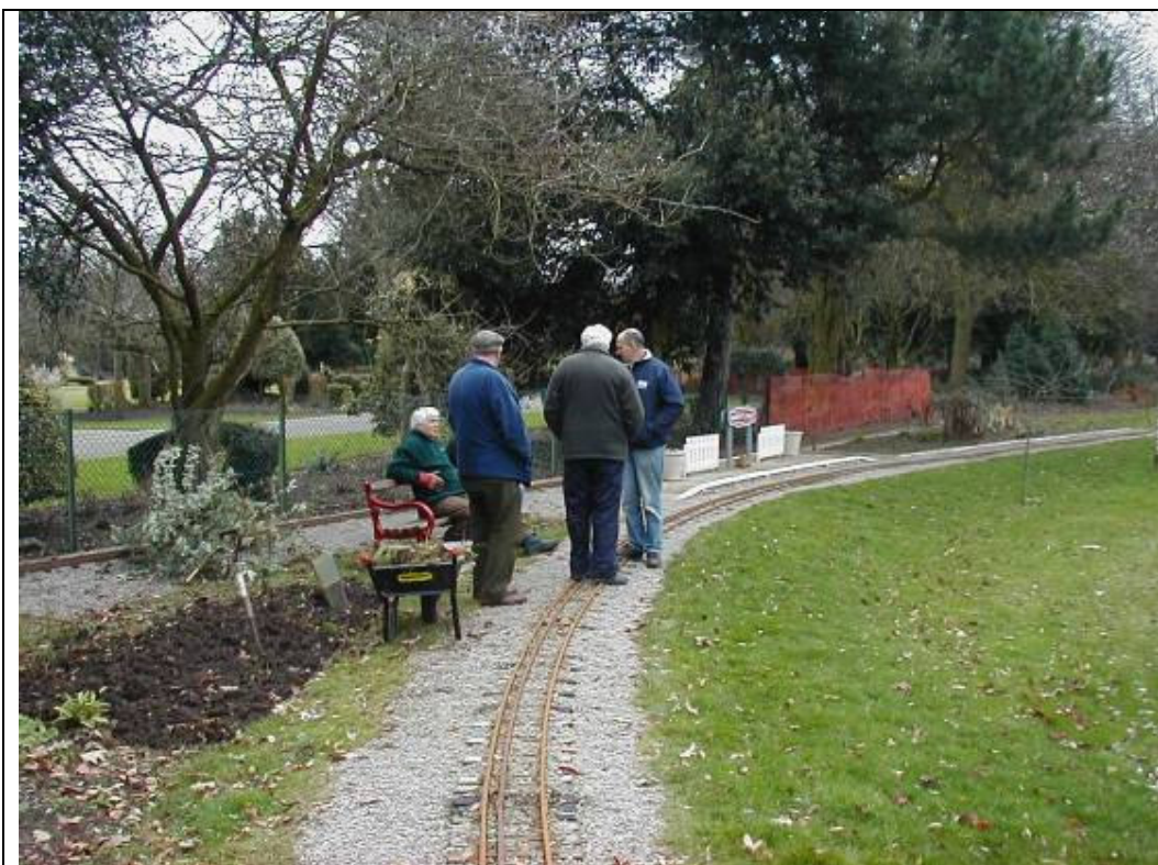
The flower beds are dug over by the Wednesday gang