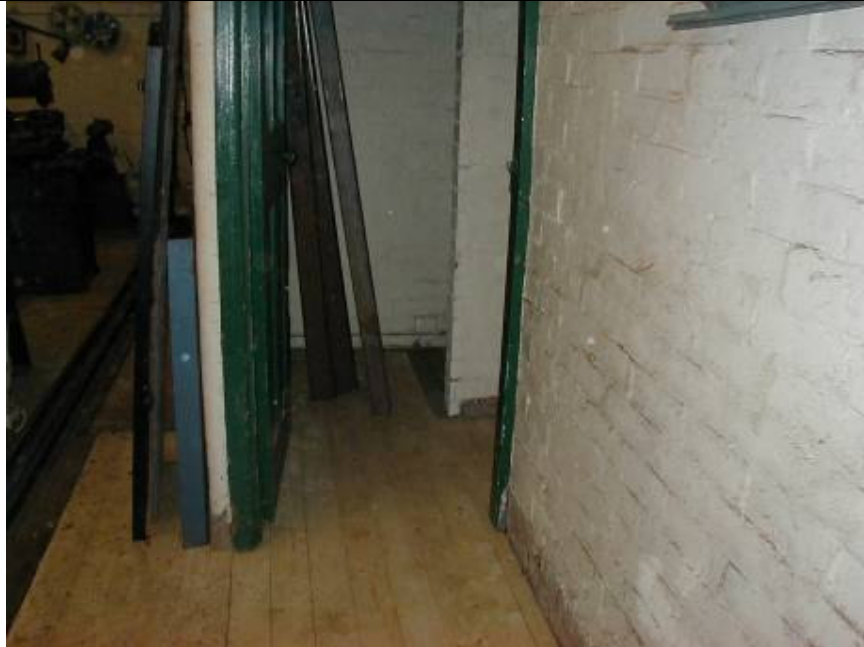
The New floor in the Pavilion workshop is completed