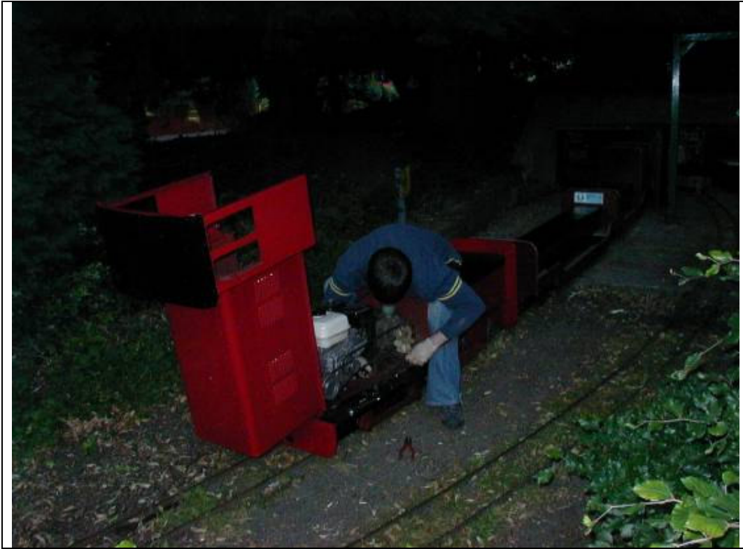
Some repairs being made to the exhaust of No4