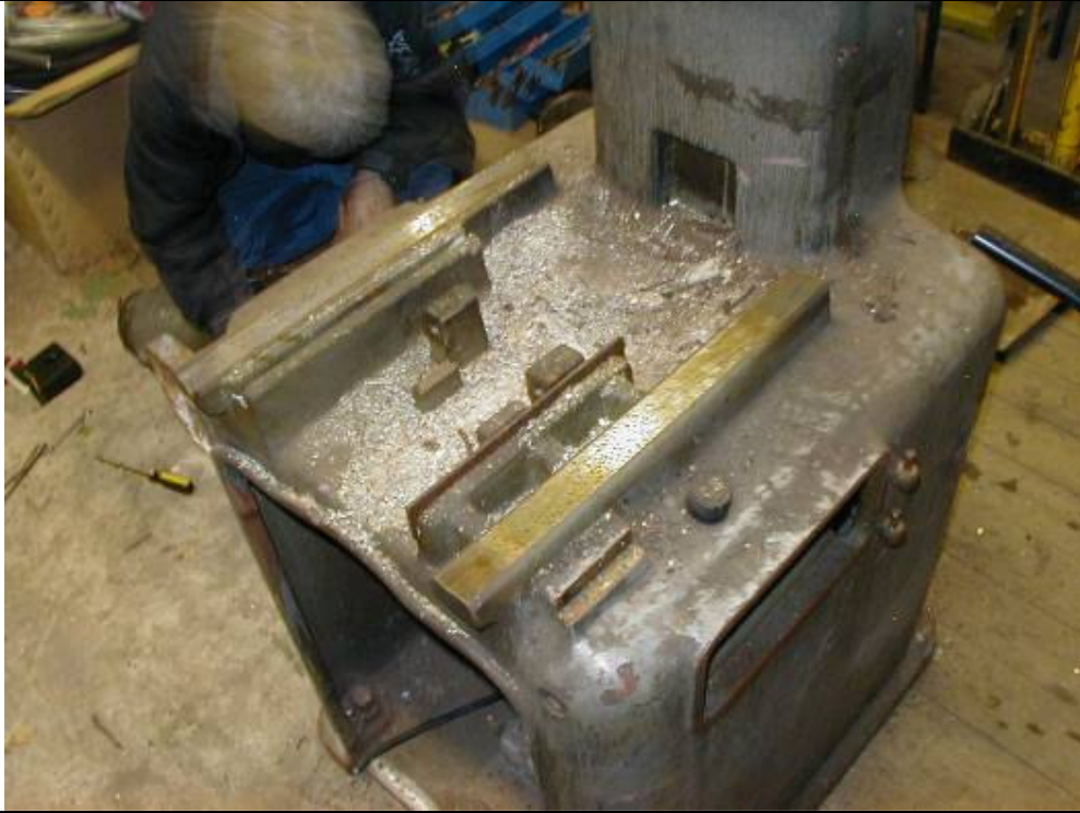
John removes as many parts possible to make the old jig borer lighter to move