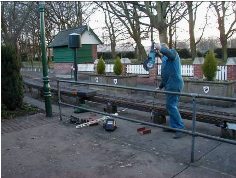
The final parts of the raised track are slotted into place bringing this mammoth task to an end