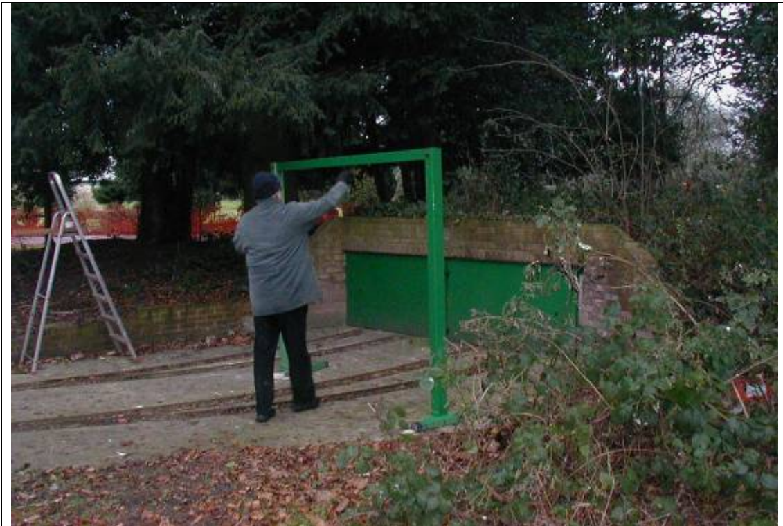
The new gantry painted and in place