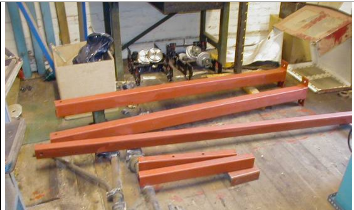
A hoist gantry that was found in the great clearout of 2009 is to be erected where it may be of some use rather than filling our store room